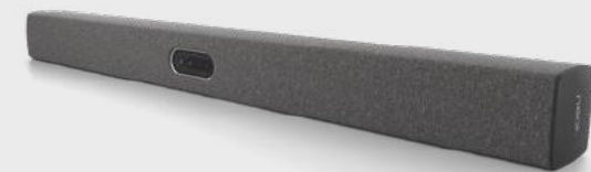
Neat Bar Pro