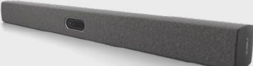
Neat Bar Pro