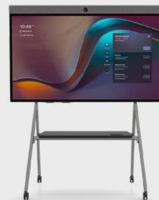
Neat Board (with floor stand)