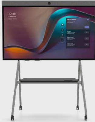
Neat Board (with floor stand)