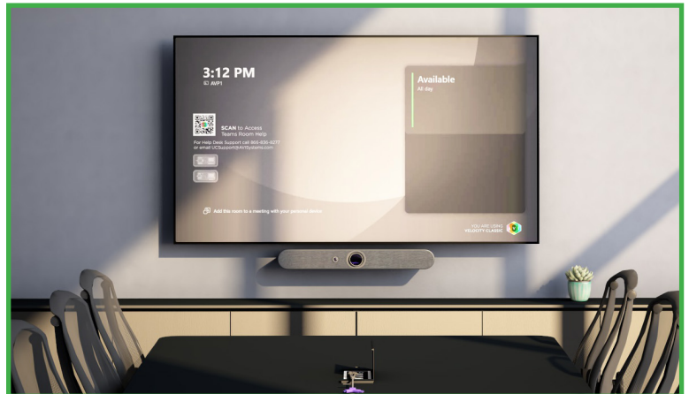
Velocity Classic Medium On-Wall solution