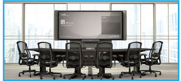
Velocity Signature Medium solution Furniture not included